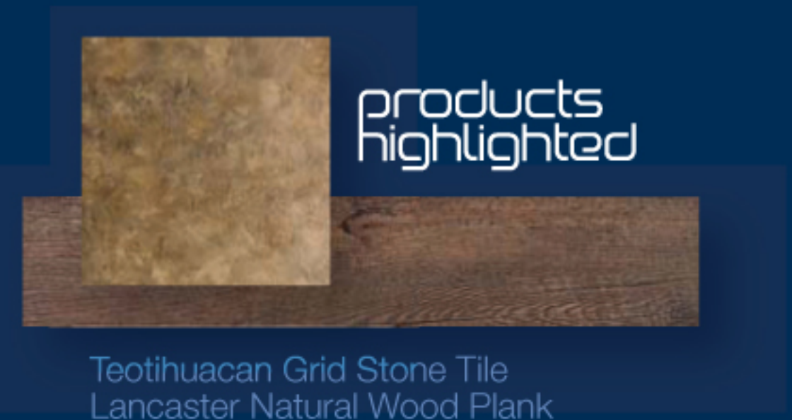
Teotihuacan Grid Stone Tile Lancaster Natural Wood Plank